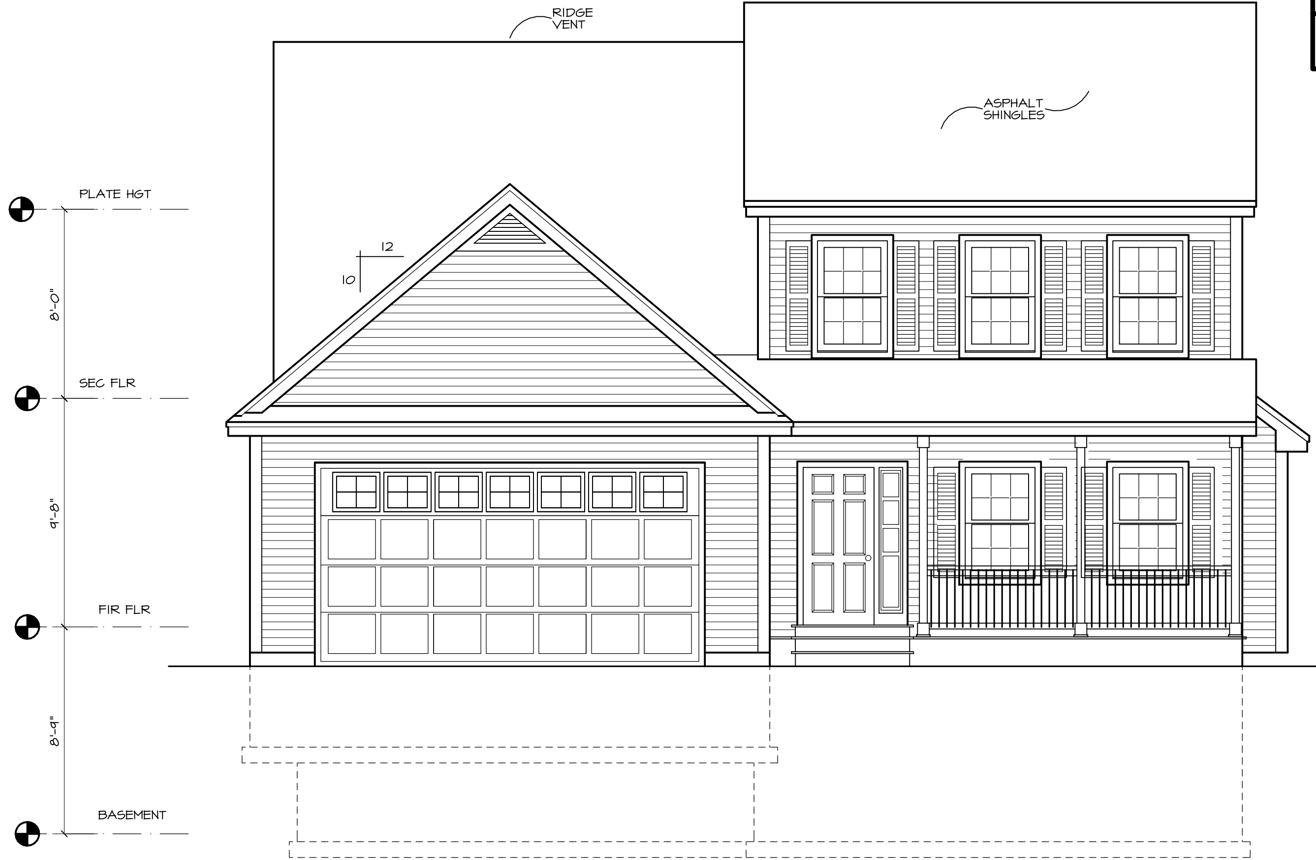
1 FRONT ELEVATION AI SCALE: 1/4" = 1'-0"

All measurements are approximate. Plan is for marketing purposes only. Builder reserves the right to make any and all necessary changes at his sole discretion.